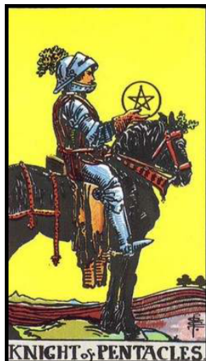
Upright Knight of Pentacles

It was not until centuries later that the cards were attributed to prophetic powers. The terms minor arcana , the 56 suit cards, and major arcana , the trump cards and the fool , originate from this period.